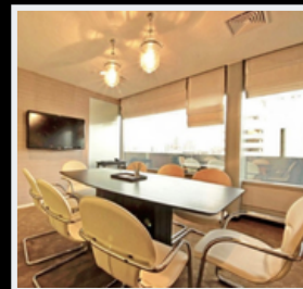
CHIT LOM 25 Chit Lom Alley