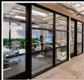
THONG LO Sukhumvit Soi.55