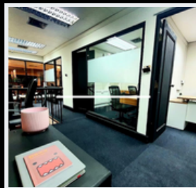
SILOM 942 Rama IV Rd