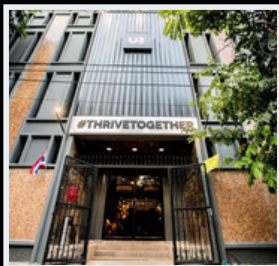
EKKAMAI Sukhumvit Soi.61

and over 40 more locations in Asia Pacific (Koh Chang, Bangsaen, Jakarta, Bali, Surabaya, Medan, Kuala Lumpur, Manila, Melbourne)